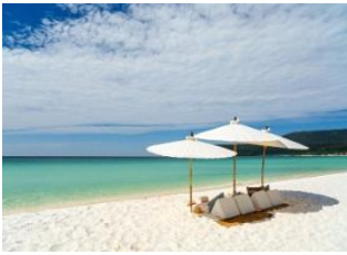
Koh Rong 📍