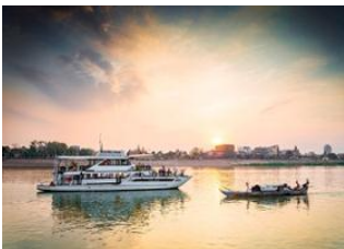
Phnom Penh 📍 10km Phnom Penh 📍