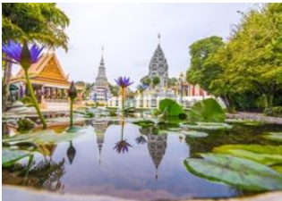
Koh Rong 📍 🚶 20km - ⌚ 1h Sihanoukville 📍 🚗 270km - ⌚ 3h Phnom Penh 📍