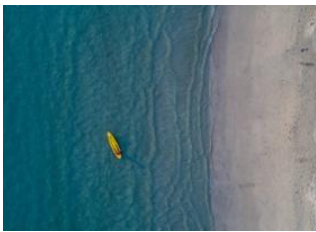
Koh Rong 📍