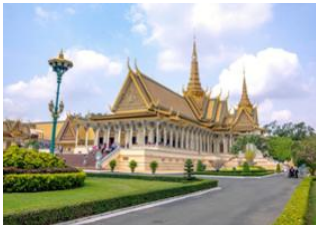
Koh Rong Samloem 📍