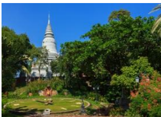
Airport Phnom Penh 📍 🚗 7km Phnom Penh 📍