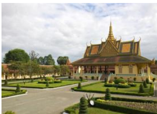
Airport Phnom Penh 📍 🚗 7km Phnom Penh 📍