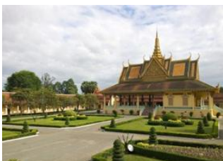
Phnom Penh 📍 🚗 Phnom Penh 📍