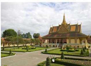
Phnom Penh 📍 🚗 Phnom Penh 📍