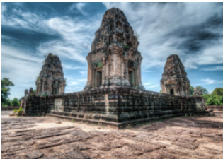
Siem Reap 📍