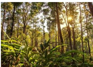
Ratanakiri 📍 7km Ratanakiri 📍