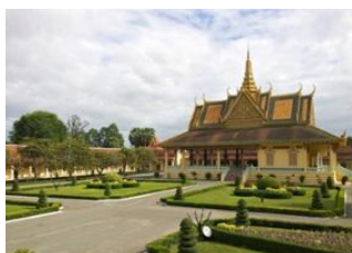
Phnom Penh 📍 🚗 Phnom Penh 📍