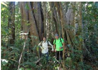
Sen Monorom 📍 🚗 200km - ⌚ 3h Ratanakiri 📍