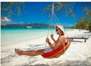
Siem Reap 📍