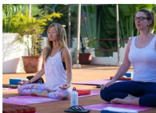
Phnom Penh 📍 6km Phnom Penh 📍