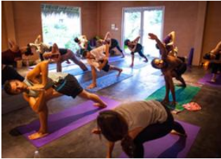
Siem Reap 📍