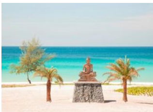
Koh Rong 📍