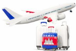
Phnom Penh 🚗 7km Départ Phnom Penh