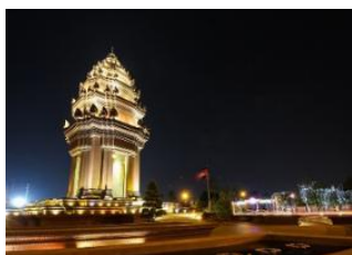
Airport Phnom Penh 📍 🚗 7km Phnom Penh 📍