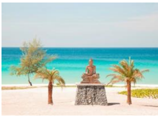
Koh Rong 📍